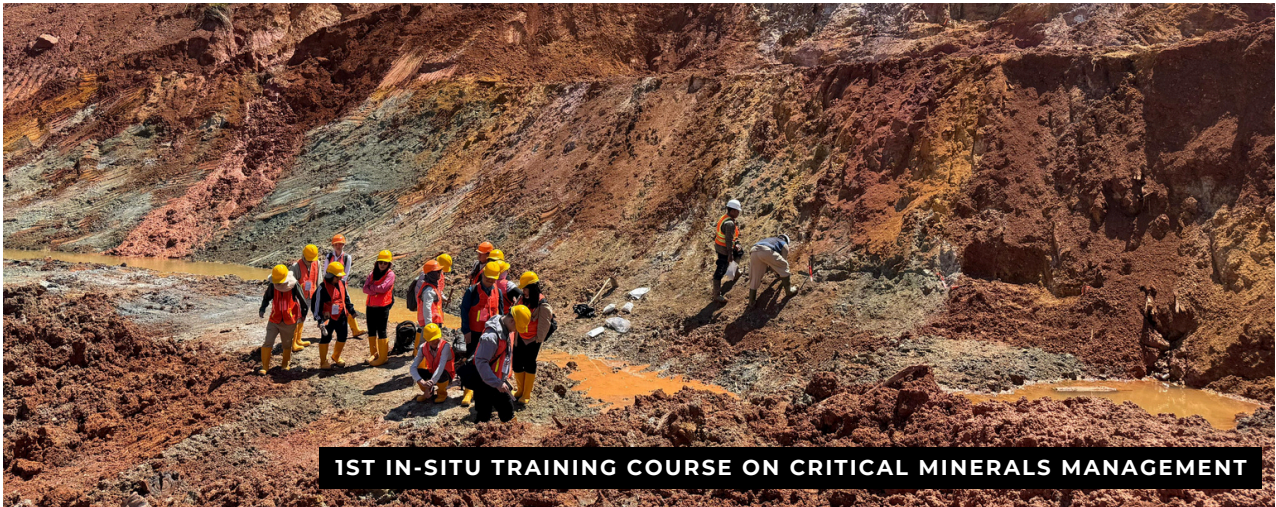
1ST IN-SITU TRAINING COURSE ON CRITICAL MINERALS MANAGEMENT